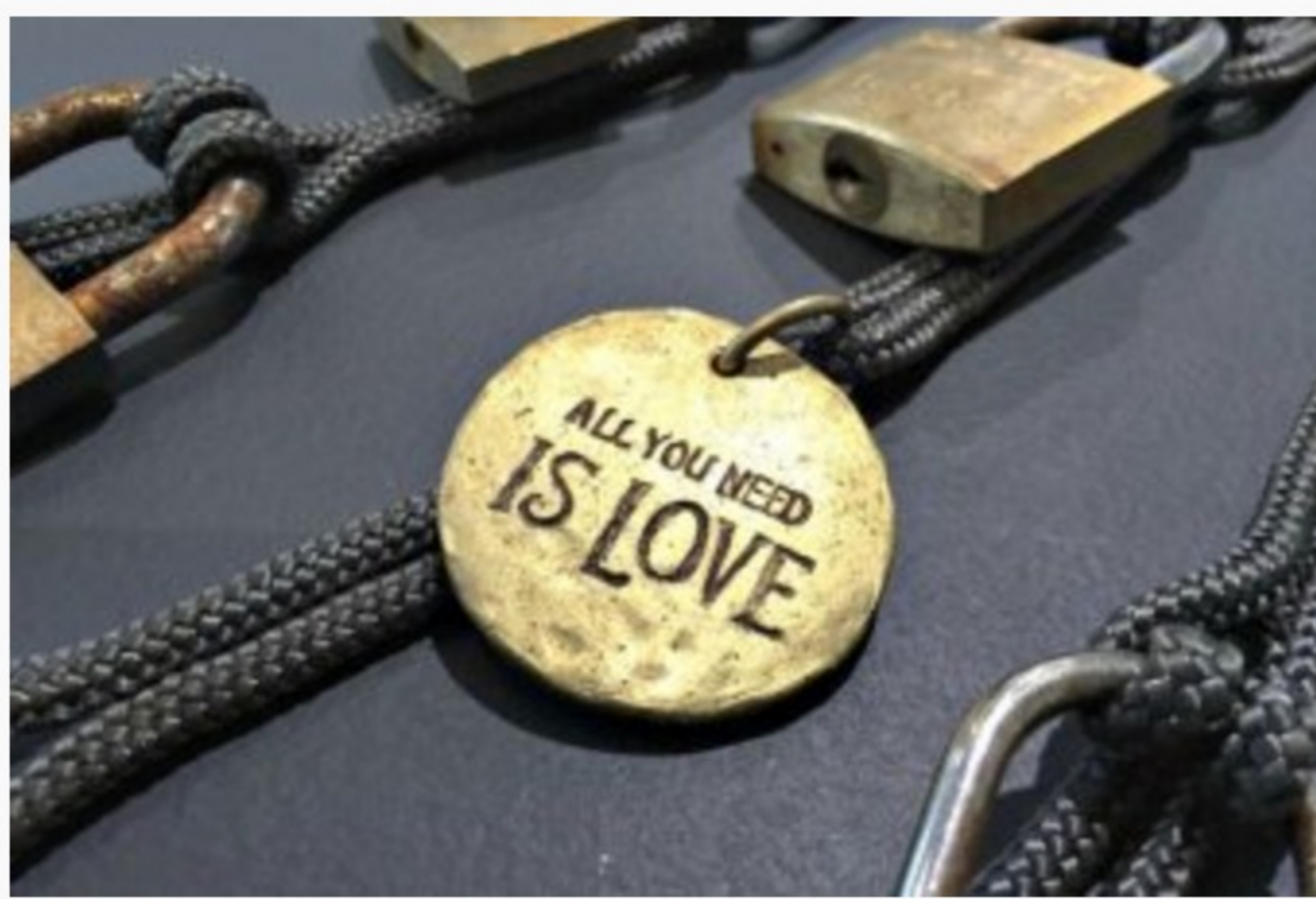
PHOTO: Love locks are turned into a work of art. (ABC News: Iskhandar Razak)