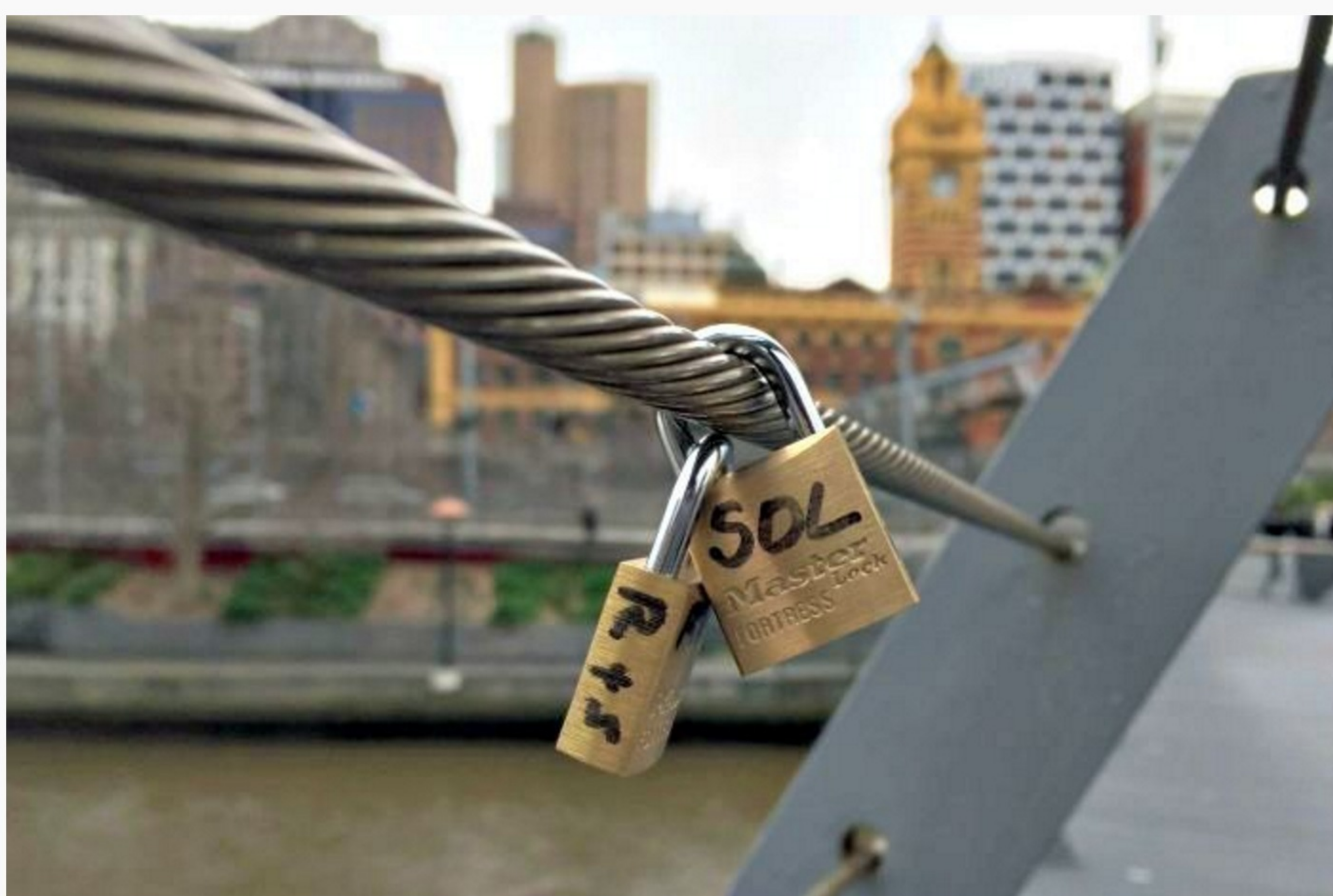
PHOTO: People continue to put locks on the bridge but they are removed every month.

About 20,000 signs of everlasting love cut down from a Melbourne footbridge have been melted, re-cast, re-filed or reformed into works of art that will be sold for charity.