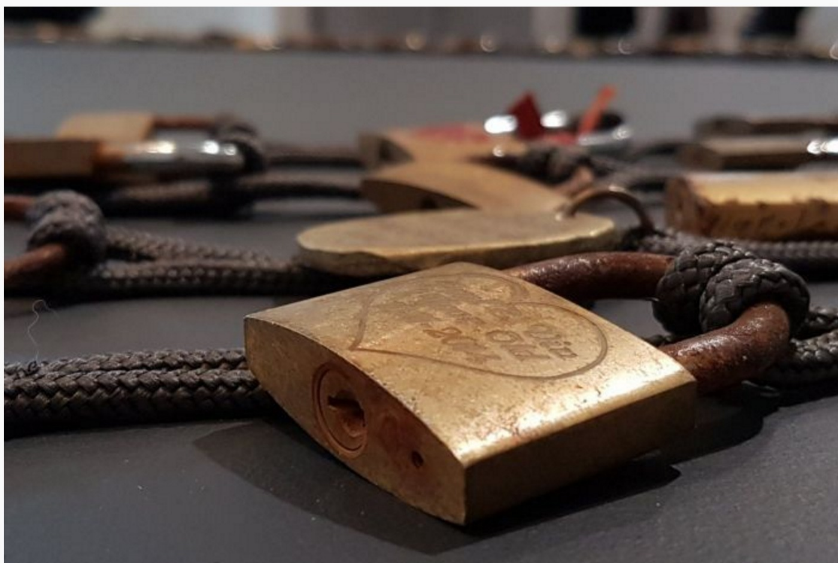
PHOTO: A lock from the Southbank footbridge now forms part of a large artwork.

Other cities where love locks have been removed en masse for safety reasons include Paris, New York, Dublin and Florence .